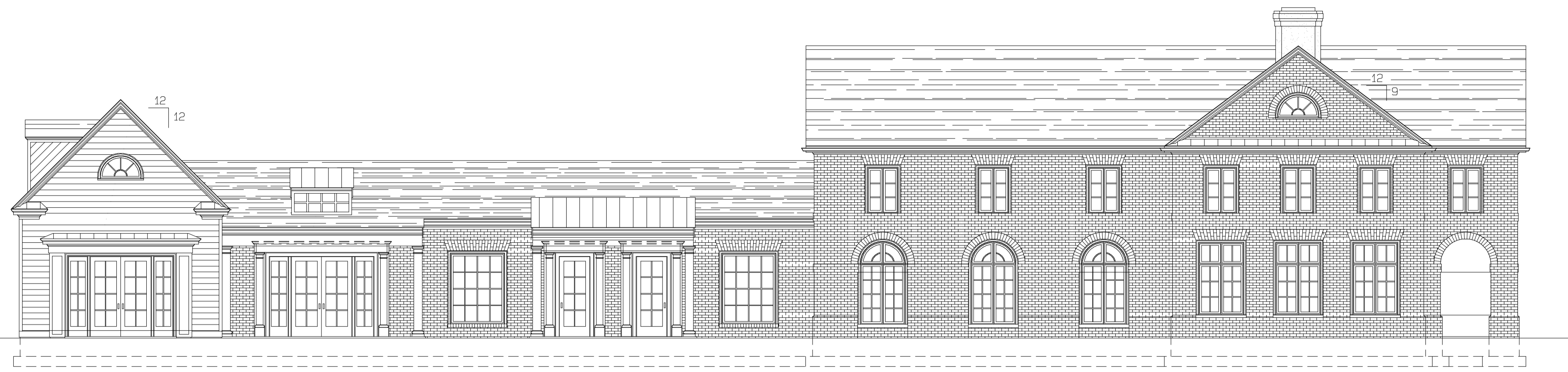
A LEFT SIDE ELEVATION A2.0 SCALE: 1/8" = 1'-0"