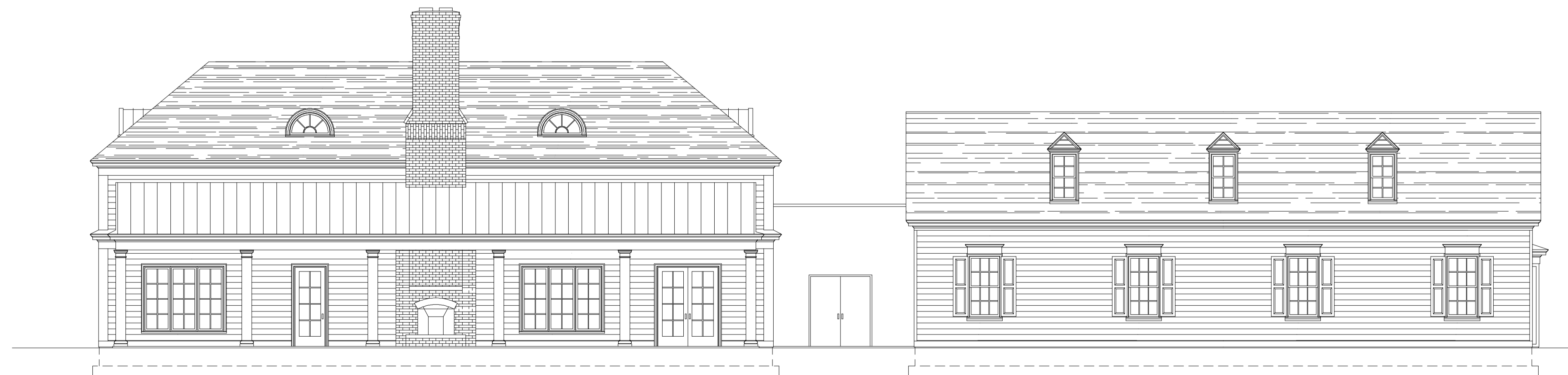
D REAR ELEVATION A2.0 SCALE: 1/8" = 1'-0"